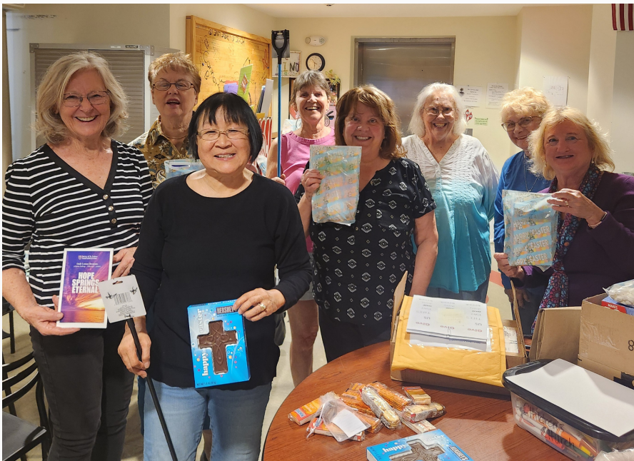
CARE Team assembling Care Packages