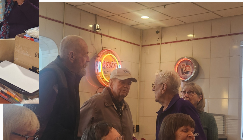
A happenstance meeting at our March’s Lunch Bunch gathering....two WWII veterans.....