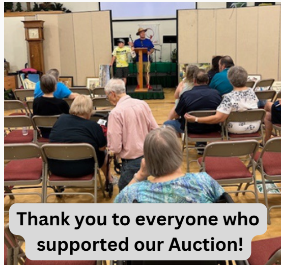
Thank you to everyone who supported our Auction!