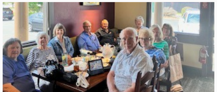
Ten of our congregation met at The Olive Garden on Thursday August 22 for a delicious meal and time of fellowship!

December 12 (Thursday) at Noon Morgan's American Grill 11717 Old National Pike, New Market, MD 21774