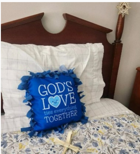
Pillow made by our youth in a Care Package recipient's home

The auction raised $2719 that will go toward the mortgage.