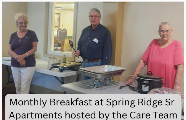
Monthly Breakfast at Spring Ridge Sr Apartments hosted by the Care Team