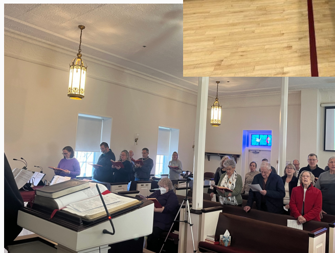
9:30am Sunday Worship