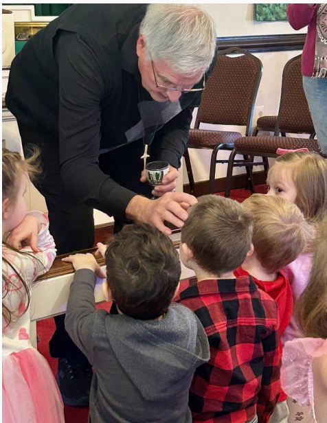
Ash Wednesday Chapel with HOPE Community Preschool